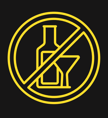
No Alcoholic Beverages